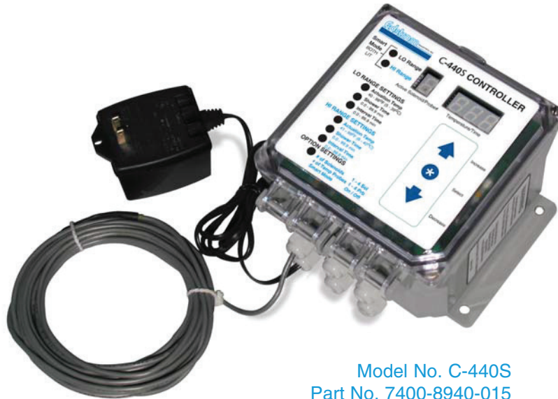
Model No. C-440S Part No. 7400-8940-015

The C-440S Controller is used to regulate the showering and interval cycles in a low-pressure livestock cooling system. This easy-to-program controller can be set to operate either in Two-Stage Mode or Smart Mode. In Smart Mode, the interval time is automatically adjusted as the temperature changes. The interval time is the period of time when no showering occurs and the water is allowed to evaporate from the animals. As temperature increases, the interval time will decrease, thus giving animals more frequent shower cycles, to reduce heat stress.